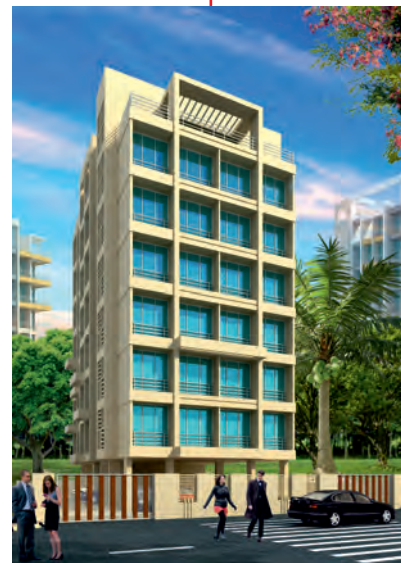
DEEP DEVANSH - 4